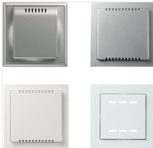
Illustration similar, variant depending on the switch range

Subject to technical alteration Issue date: 25.03.2021 • A110